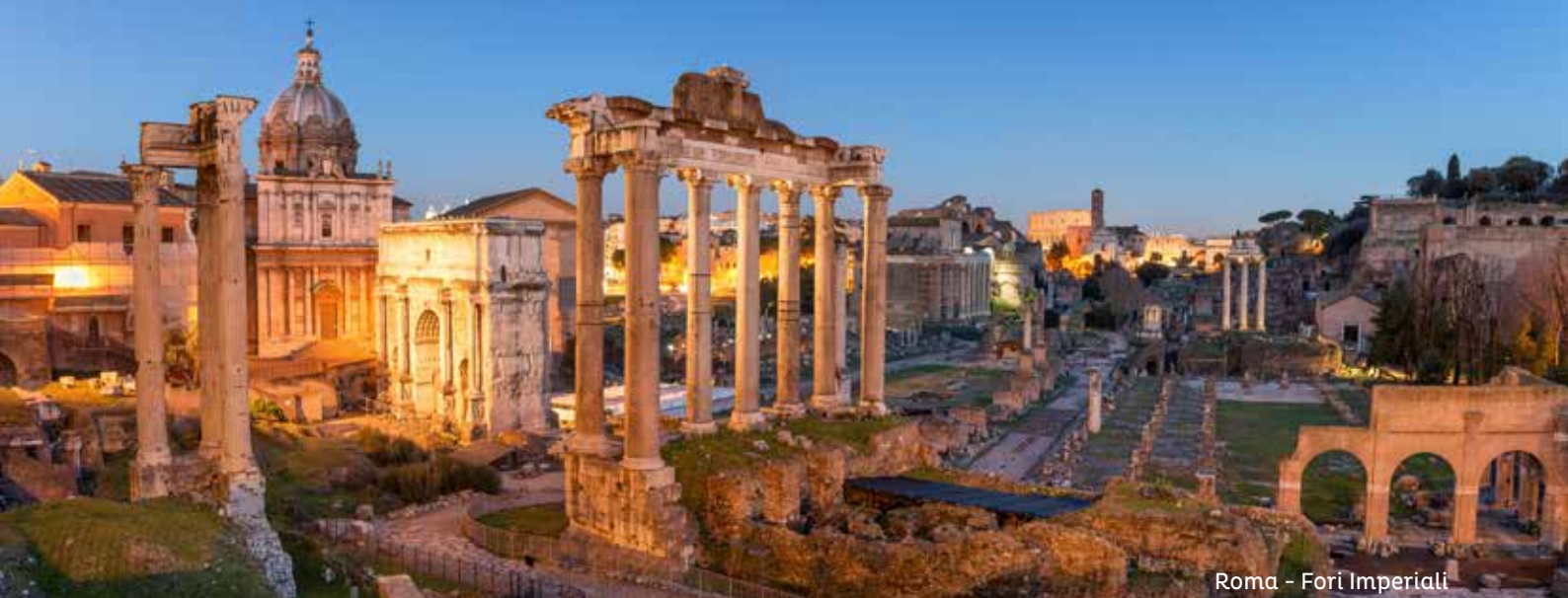
Roma - Fori Imperiali