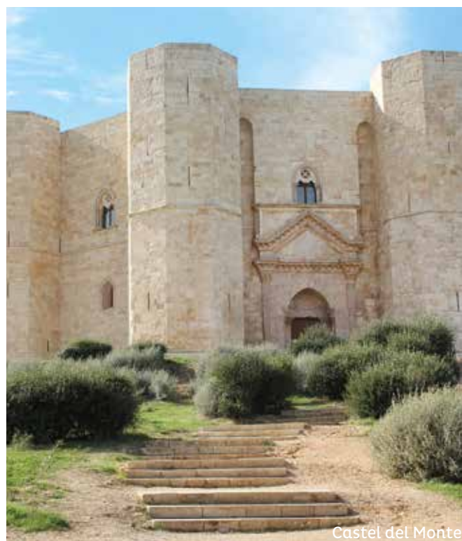
Castel del Monte