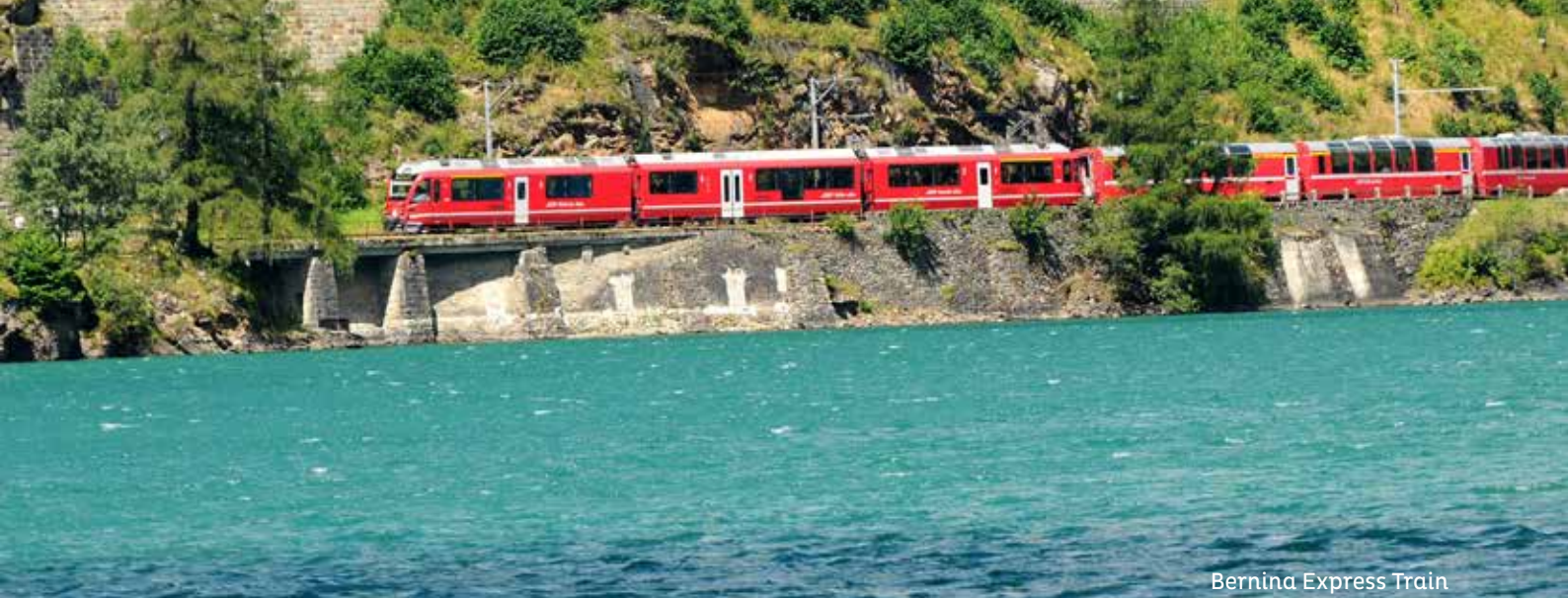
Bernina Express Train