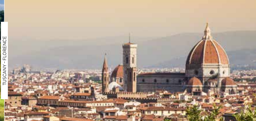
TUSCANY - FLORENCE